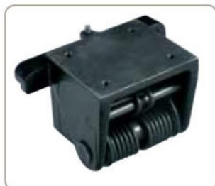
Ideal for spindle moulders for convenient feed disengagement. (optional extra)