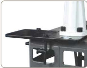
Optional assembly plate QH-01 to allow for quick and easy attachment ( Baby M3 / AF 32)