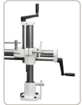
Individually adjustable and tilttable stand