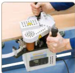
Ideal for application of adhesives onto straight or curved workpieces (whether concave or convex shapes)