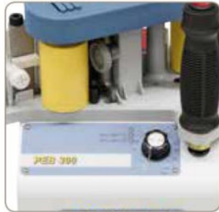
The required working temperature is set by potentiometers.