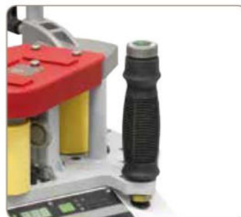
Convenient feed adjustment on handle from 2 - 6 m/min, ideal for processing of different workpieces