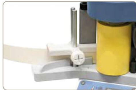
The adjustable guide system allows edge bands from 0.3 - 3 mm and edge heights from 10 - 65 mm