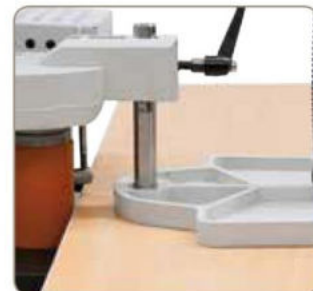
Height adjustable guide plate for panels measuring 10 - 55 mm in thickness