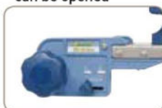
Scale for setting the edge protrusion