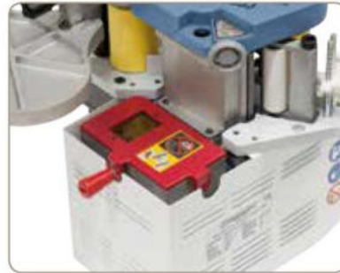
Lockable glue chambers ensure for high safety - no risk of burn if machine gets tilted

Info for edge bending set PEB 300 S see page 305