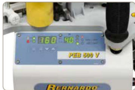
Clearly arranged control panel, operation via membrane keypad.

Info for edge bending set PEB 500 V-S see page 305