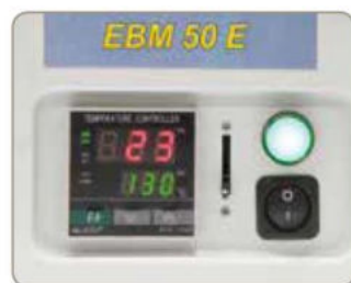
Quick adjustment of desired temperature