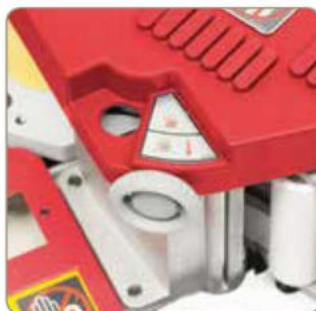
The supplied amount of glue can be set exactly via a rotary knob.