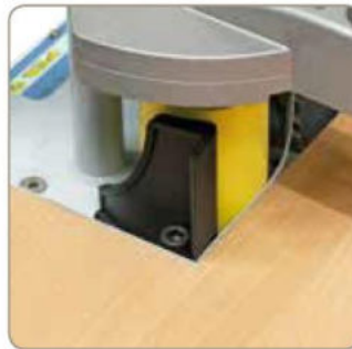
Standard with guide plate for attaching the edge material in corners.