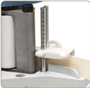
Quick and easy adjustment of the desired edge height by scale