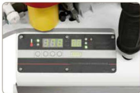
Clearly arranged control panel, operation via membrane keypad.