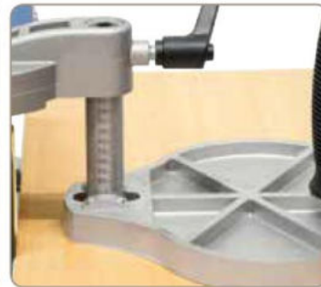
Height adjustable guide plate features scale to adjust to each workpiece