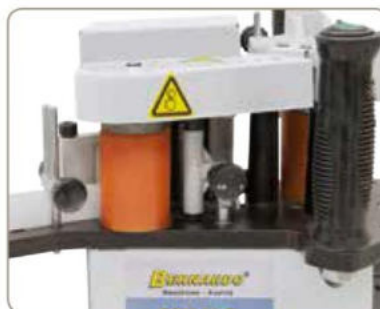
The adjustable guide system allows edge bands from 0.3 - 3 mm and edge heights from 10 - 55 mm